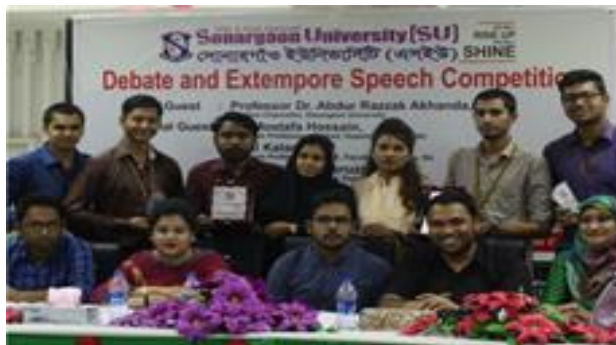
Parliamentary Debate and Extempore Speech Competition

Established in 2012, the Department of Civil Engineering is one of the oldest and largest department of SU. Its goals are to produce outstanding civil engineering with advanced skills and knowledge for professional practice. The department is committed to provide a dynamic learning environment that emphasizes open-ended design, problem-solving skills, team-work, communication, motivated and leadership skills. SU has recruited a large number of highly qualified, motivated, scholarly, knowledgeable and dedicated faculty members who have studied in most prestigious and competitive universities of home and abroad. Some worth citing features are: