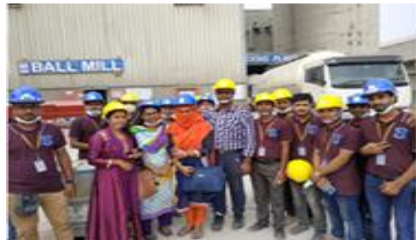
Industrial Visit to Akij Cement Manufacturing Plant