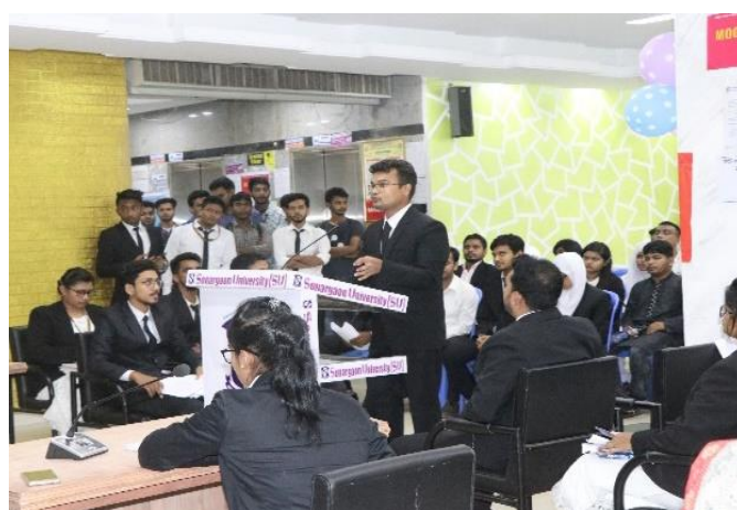
Final session of the moot court competition,2019