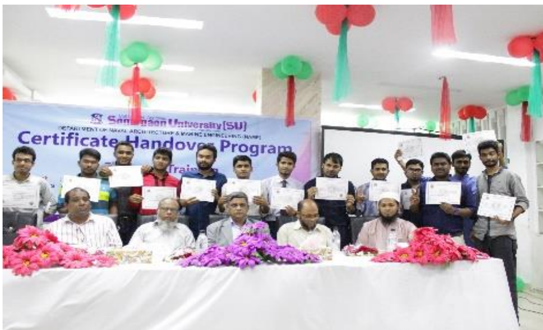
Certificate giving ceremony