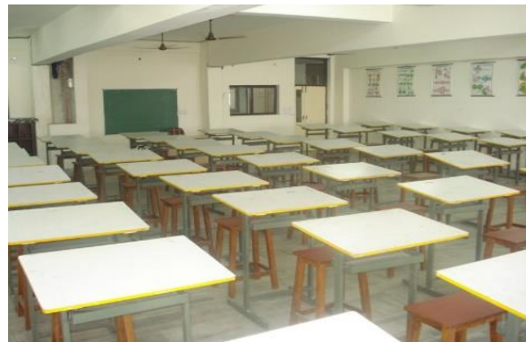
Ship Design Laboratory