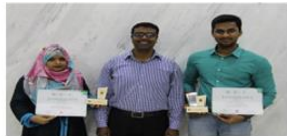
Achieved 2nd position in CAD Master of Eccentric 2018 Held at BUET