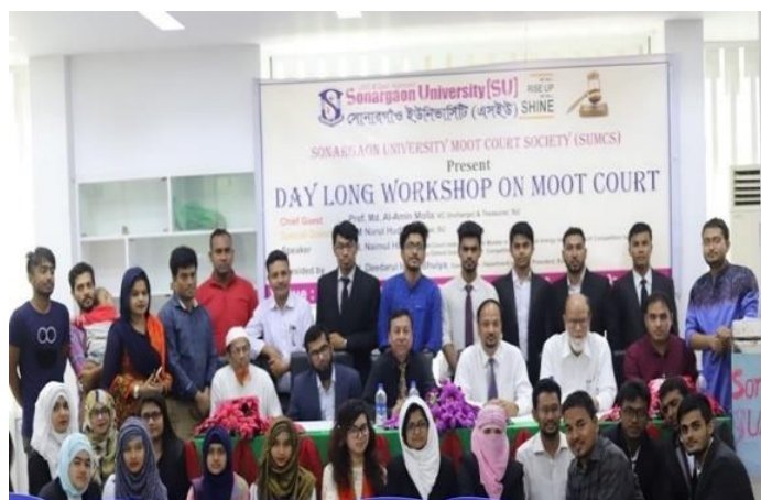
Day long workshop on moot court

The Department of Law belives that legal education should not be based only on plain text rather emphasizes on providing thestudents a learning environment that equips them to become lifelong learners by integrating strong discipline based knowledge and the development of professional capabilities. The coursework program for the both undergraduate and graduate students reflect the latest development of law within the practice and profession. Several legal luminaries of the county are involved that Sonargaon University Moot Court Society (SUMCS) platforms the students to engage themselves for preparing moot cout competition and research.