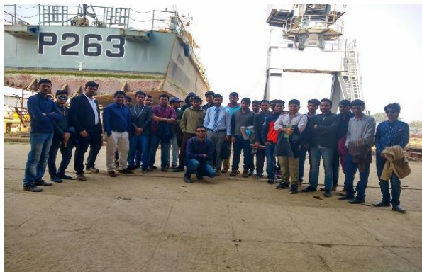
Industrial Training in Khulna Shipyard

The department of NAME arrange one-month practical shipyard training for the 3 rd year students in Khulna Shipyard which is the oldest and largest shipyard of Bangladesh.